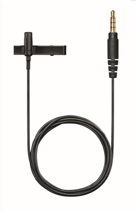
Shure MOTIV MVL Lavalier Microphone User Friendly Tie-Clip