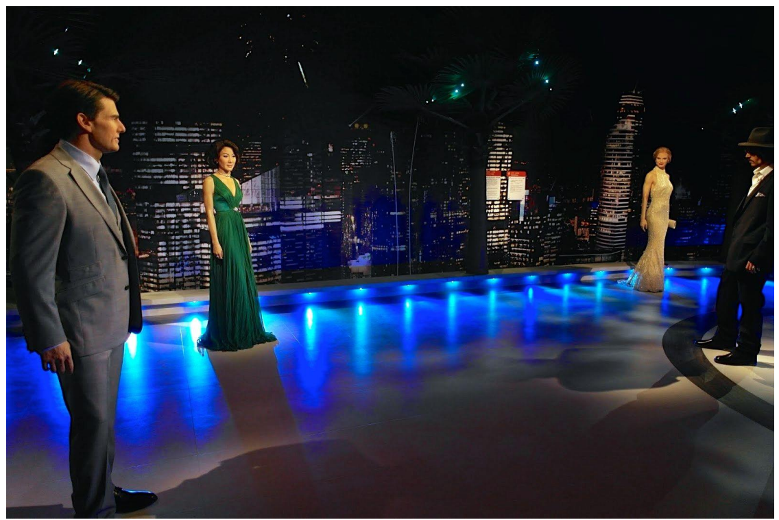
Symetrix SymNet Radius 12x8 open architecture Dante-scalable DSPs are providing flexible processing for the celebrity waxwork museum's latest location.

SINGAPORE — FEBRUARY 2015: The power and scalability of Symetrix SymNet Radius 12x8 open architecture Dante-scalable DSPs has made them an increasingly popular choice for large-scale visitor attractions. Now Madame Tussauds has been added to the roll-call with a SymNet Radius 12x8-centric audio processing and distribution infrastructure at its new site in Singapore.