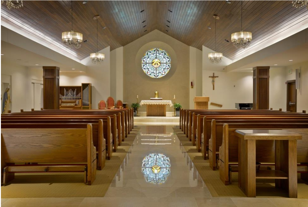
Saint Agnes Chapel

Founded by the Daughters of Charity in 1862, Saint Agnes Hospital is a full-service teaching hospital in Baltimore, Maryland with residency programs in medicine and surgery. As part of a recent expansion program, Saint Agnes renovated its chapel in 2013. The newly renovated chapel retains historic features like a circular stained glass window but includes new marble floors and freshly painted walls.