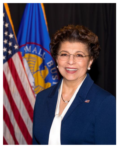
Administrator Jovita Carranza

The U.S. Small Business Administration (SBA) is offering designated states and territories low-interest federal disaster loans for working capital to small businesses suffering substantial economic injury as a result of the Coronavirus (COVID-19).